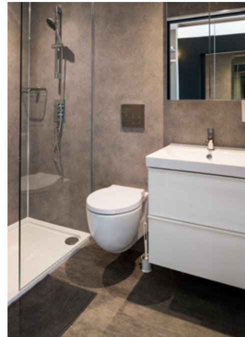
Cool Mica used in ensuite shower room and Multipanel Piemonte Flooring, Farrier House.

Stannary Solutions also intend to use Multipanel in further student developments.