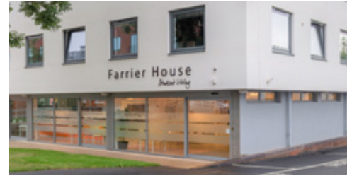
Photos of Farrier House Student Living, courtesy of Stannary Solutions Limited.

“We also act as landlords at Farrier House, so it was important for us to ensure tight control over future ongoing maintenance costs, and that’s one of the reasons why we selected high quality contemporary products like Multipanel that require only minimal maintenance and are easy to clean — ones tough enough to withstand the inevitable heavy wear and the occasional knock from residents.